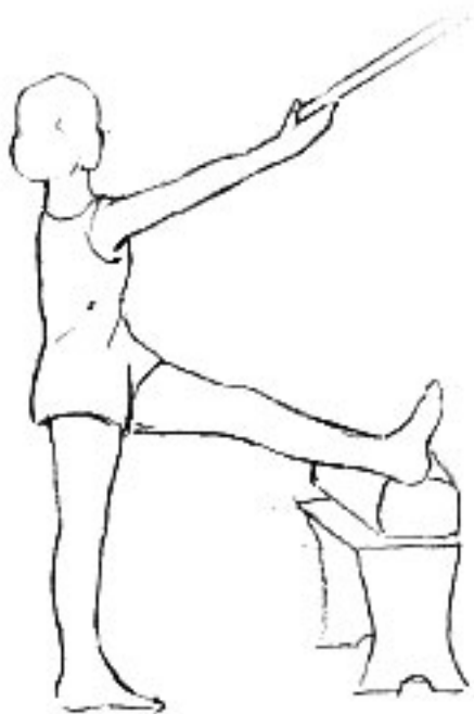
UTTHITA HASTA PADANGUSTHASANA