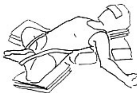
SUPTA BADDHA KONASANA